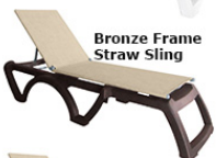
Bronze Frame Straw Sling