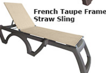
French Taupe Frame Straw Sling