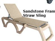
Sandstone Frame Straw Sling