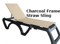
Charcoal Frame Straw Sling