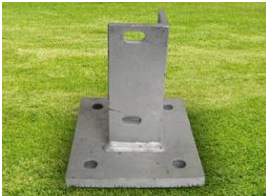
#1306 Surface Mounting Base