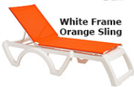
White Frame Orange Sling