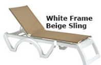
White Frame Beige Sling