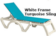
White Frame Turquoise Sling