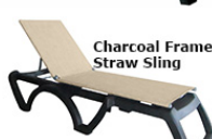
Charcoal Frame Straw Sling