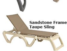
Sandstone Frame Taupe Sling