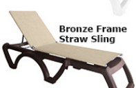
Bronze Frame Straw Sling