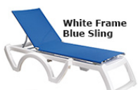
White Frame Blue Sling