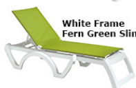
White Frame Fern Green Sling