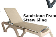
Sandstone Frame Straw Sling