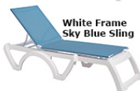
White Frame Sky Blue Sling