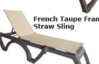
French Taupe Frame Straw Sling