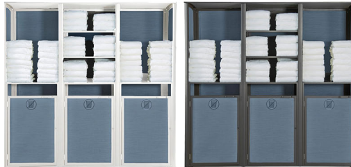
Madras Blue/Glacier White Madras Blue/Volcanic Black