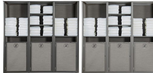
Solid Gary/Volcanic Black Solid Gray/Platinum Gray