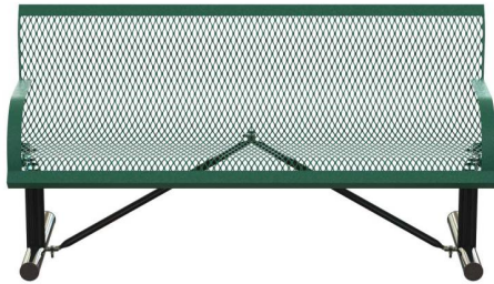
Wingline Bench Portable