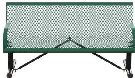
Wingline Bench Portable