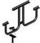
Inground Mounting Clamp