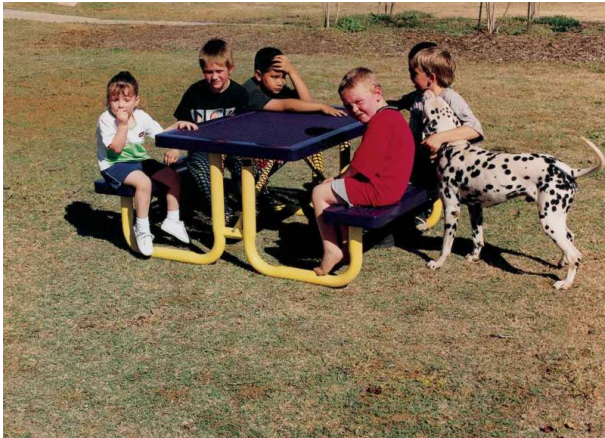
Portable Table Mounting Options